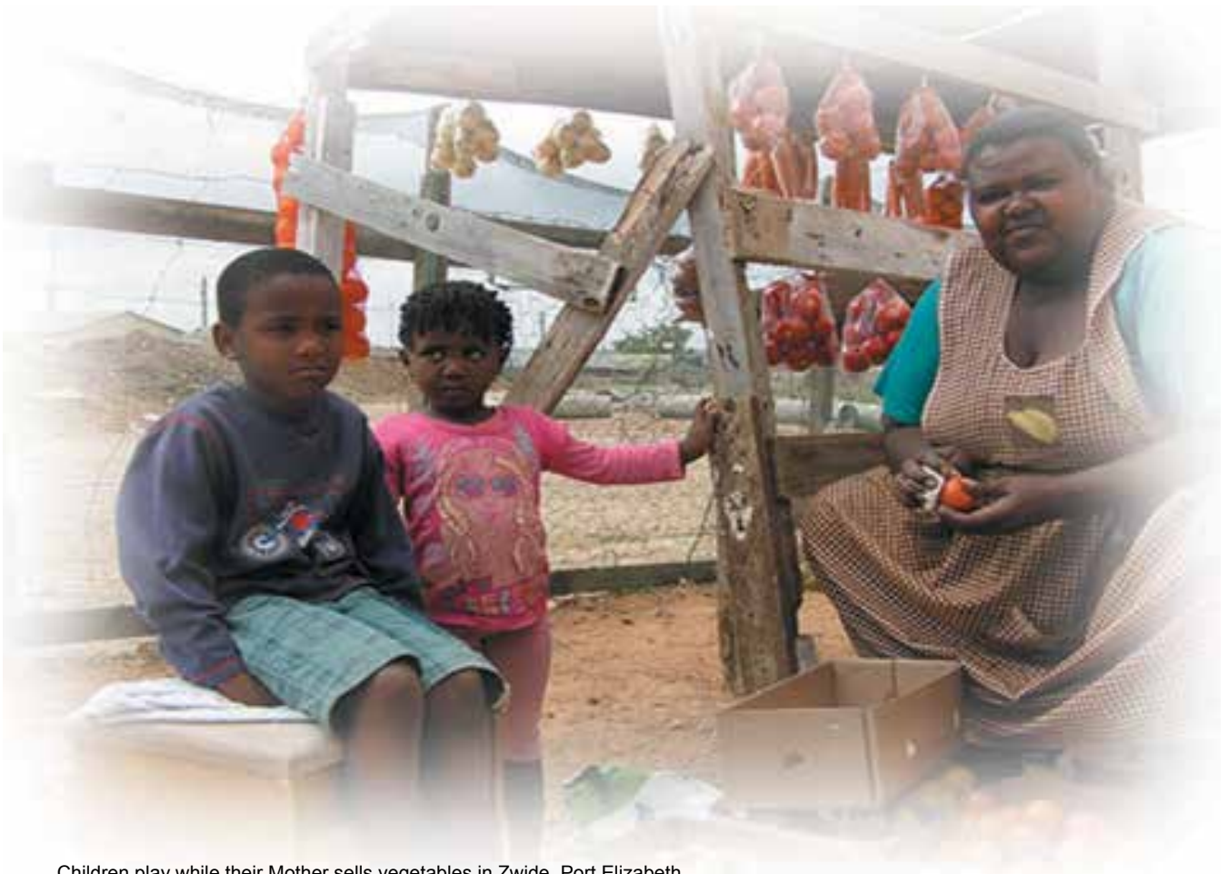
Children play while their Mother sells vegetables in Zwide, Port Elizabeth. She re-packs vegetables for her customers in quantities which they can afford.