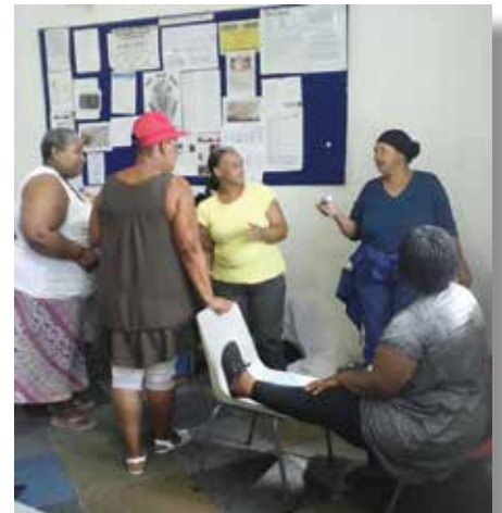
The Women's Circle