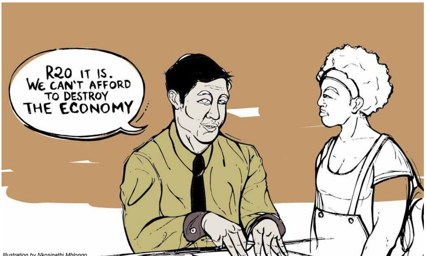
Illustration by Nkosinathi Mhlongo

dominant discourse – particular way of talking about issues and subjects by those who hold positions of political and economic power. These 'particular ways' are repeated and passed on and become 'normalised'. Many, including those in the social majority, believe them to be true. Often they are false