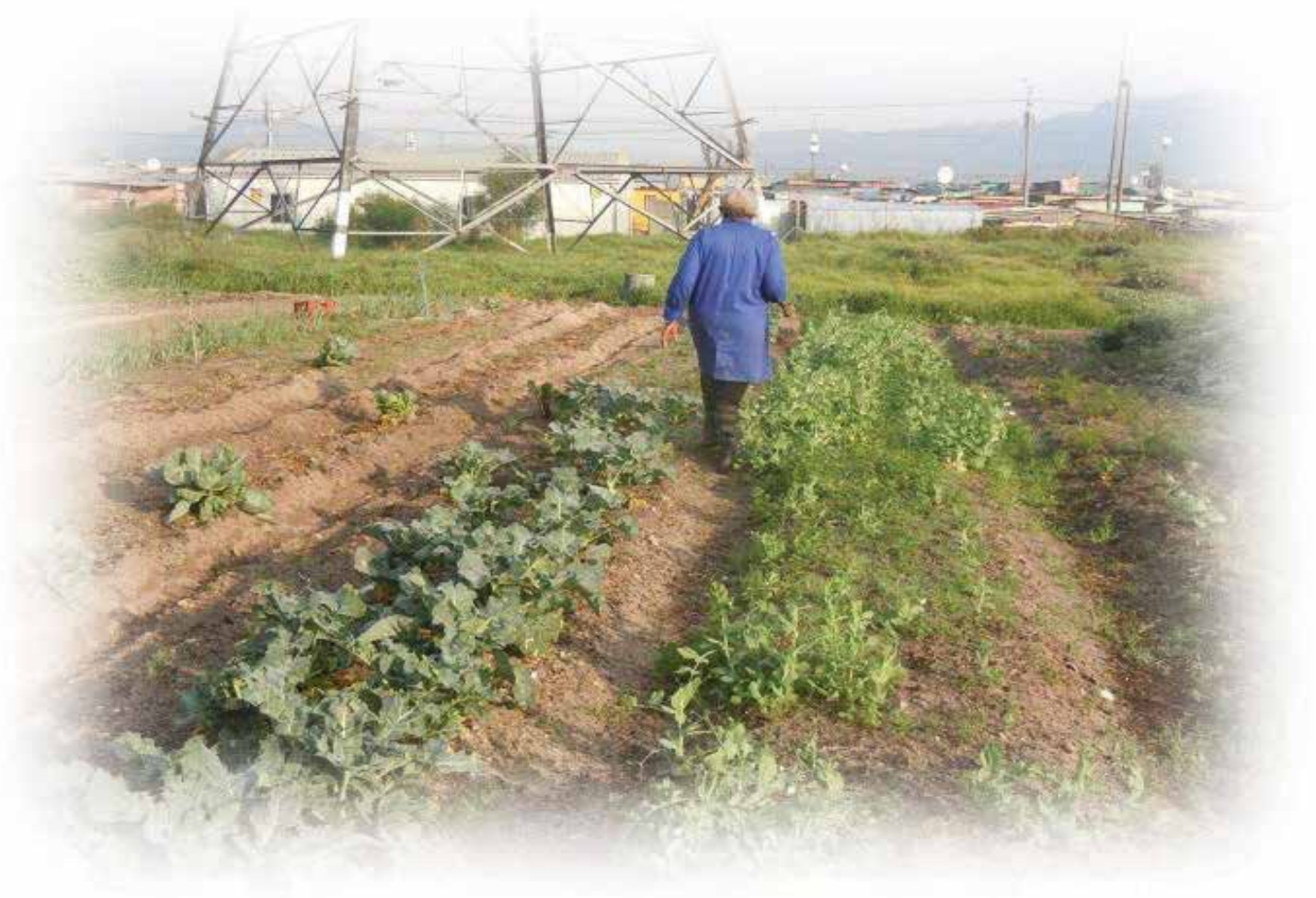
Abalimi Bezekhaya farmer, Cape Flats