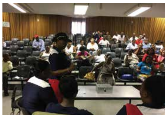
A play being done for community educators to generate discussion about what community education is and how it can be brought to life from experiences and interests of community members members (CEP).

people in such circumstances by providing suitable skills. Education must also cater for the needs of communities by assisting them to develop skills and knowledge which are not necessarily aimed at income generation – for example: community organisation; knowledge of how to deal with government departments or commercial enterprises such as banks; citizenship education; community health education; literacy. The proposed community colleges are expected to play a particularly important role in this regard, and must therefore be designed to be flexible in meeting the needs of their own particular communities. The colleges must build on the experiences and traditions of community and people's education developed by non-formal, community-based and non-governmental organisations over many decades.