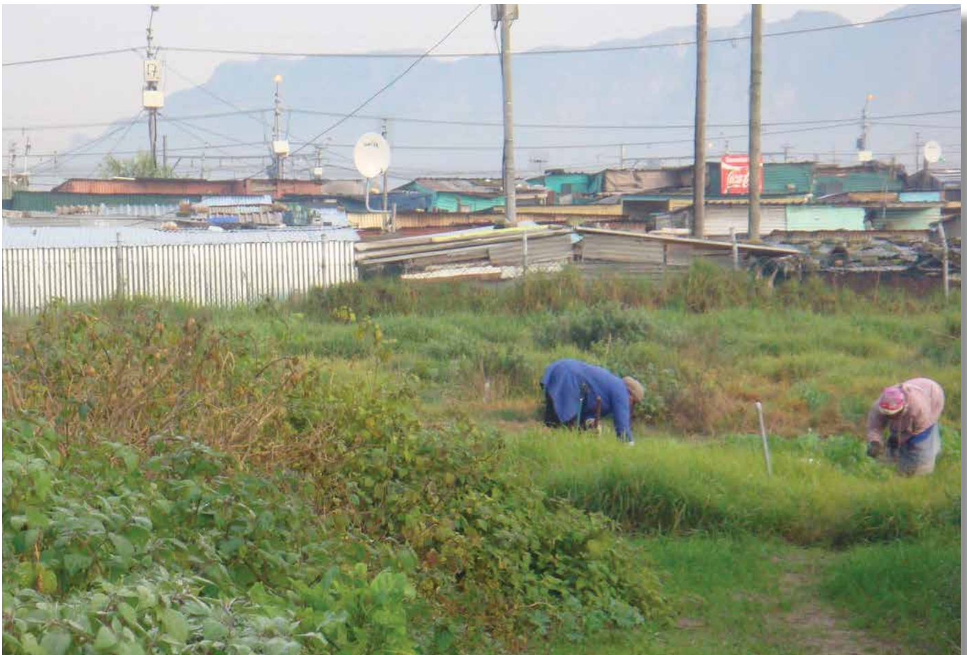
Abalimi Bezekhaya farmers, Cape Flats

We met people in Ikemeleng (North West) who use alternative ways to generate power in the absence of electricity. Solar panels are used to power television sets and to charge cell phone batteries. Car batteries are used with energy converters to power most household appliances.