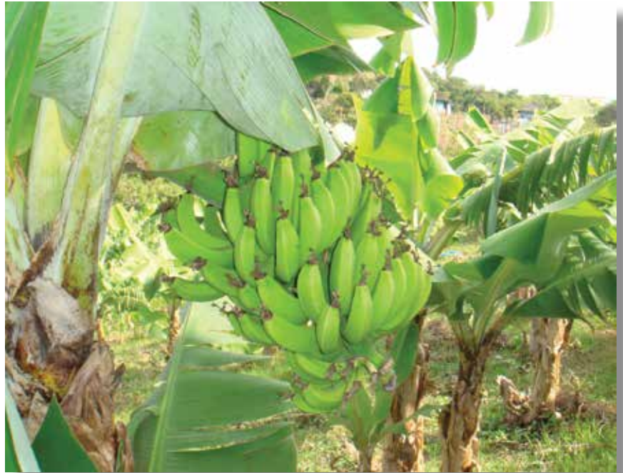
Noqhekwana Village, near Port St Johns (Is'baya Development Trust)

We met many farmers (mainly female) who share their knowledge and skills with others, such as an Abalimi Bezekhaya farmer (Cape Flats, Western Cape) who told us that when she goes back to her home in the Eastern Cape, she is greeted with: 'Nanku umlimi esiza' ( Here comes the farmer ). Her family, friends and other community members know she will teach them what she has learnt. She also said to us: 'Ndiyasithanda isitiya, nangoku, ndisithanda kakhulu. Ndiyasithanda' ( I still love the garden, still now, I'm so passionate about it. I love it ).