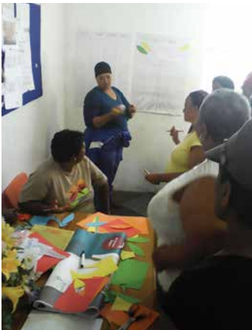
The Women's Circle

Adapted from: http://www.reflect-action.org/node/37