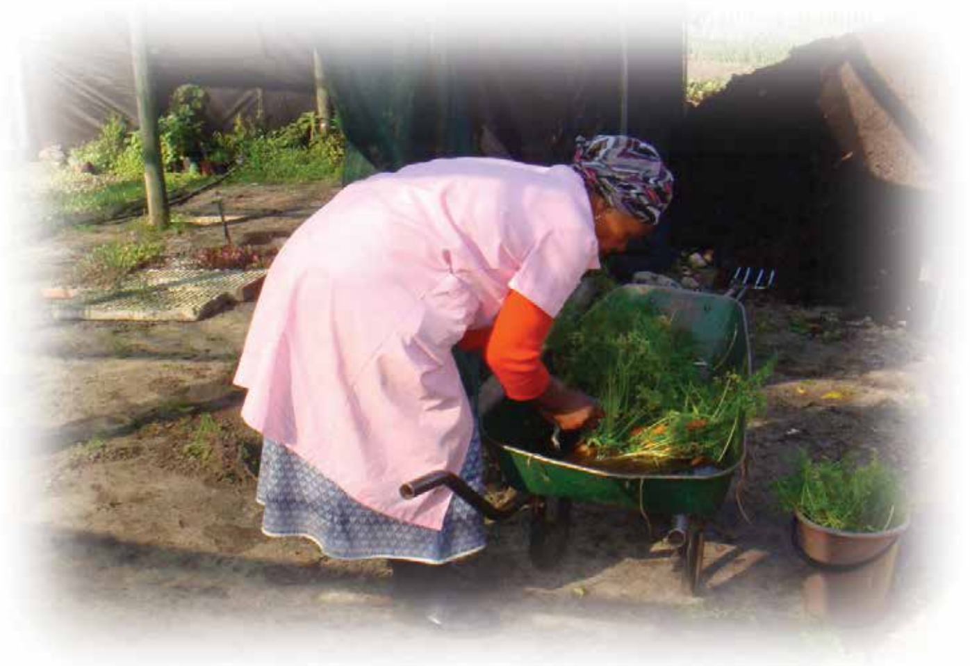
Abalimi Bezekhaya farmer, Cape Flats